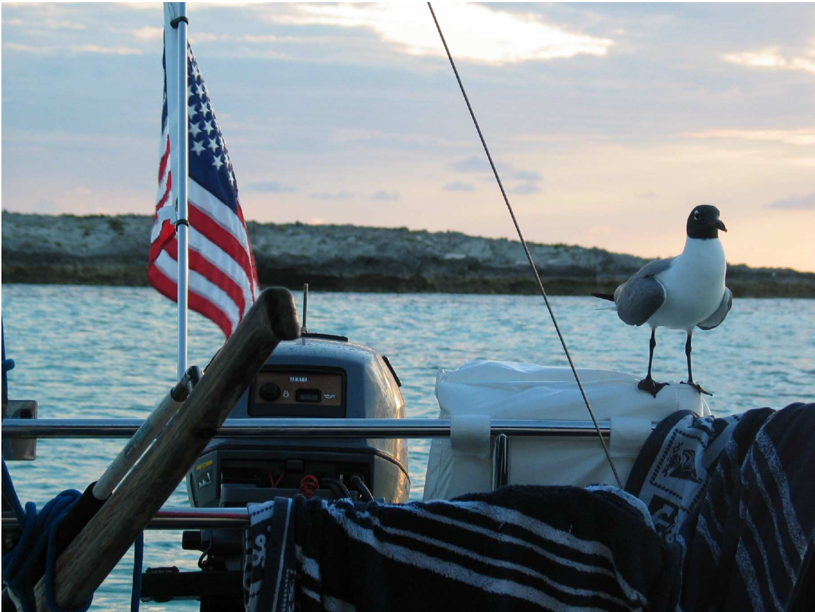
Early evening visitor looking for handouts at Honeymoon Harbour

As we arrived at the east side of Cat Cay, the afternoon had turned to early evening and it was time to look for resting place for the night. Cat Cay had a marina, but we didn't much want to stay there as it looked a bit too ritzy and not sailboat friendly. There was not a mast to be seen. There was one large yacht anchored to the east side of Cat Cay, but the holding didn't look too good to us and, more importantly, it was totally exposed to the 10-12 knot east wind that was blowing across the entire Banks. So we pressed on up to the northern end of Gun Cay where there was a nice crescent shaped anchorage called Honeymoon Harbour.