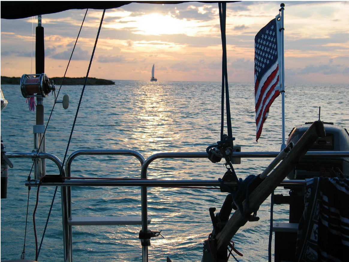
Cruising catamaran sailing into the sunset

As we finished dinner, we were treated to, that's right, another beautiful sunset that made for a great photo op as a catamaran sailed off into the sunset bound for the northern Bahamas. Another highlight of the evening was a visiting seagull that perched on our stern rail for some time waiting for a handout.