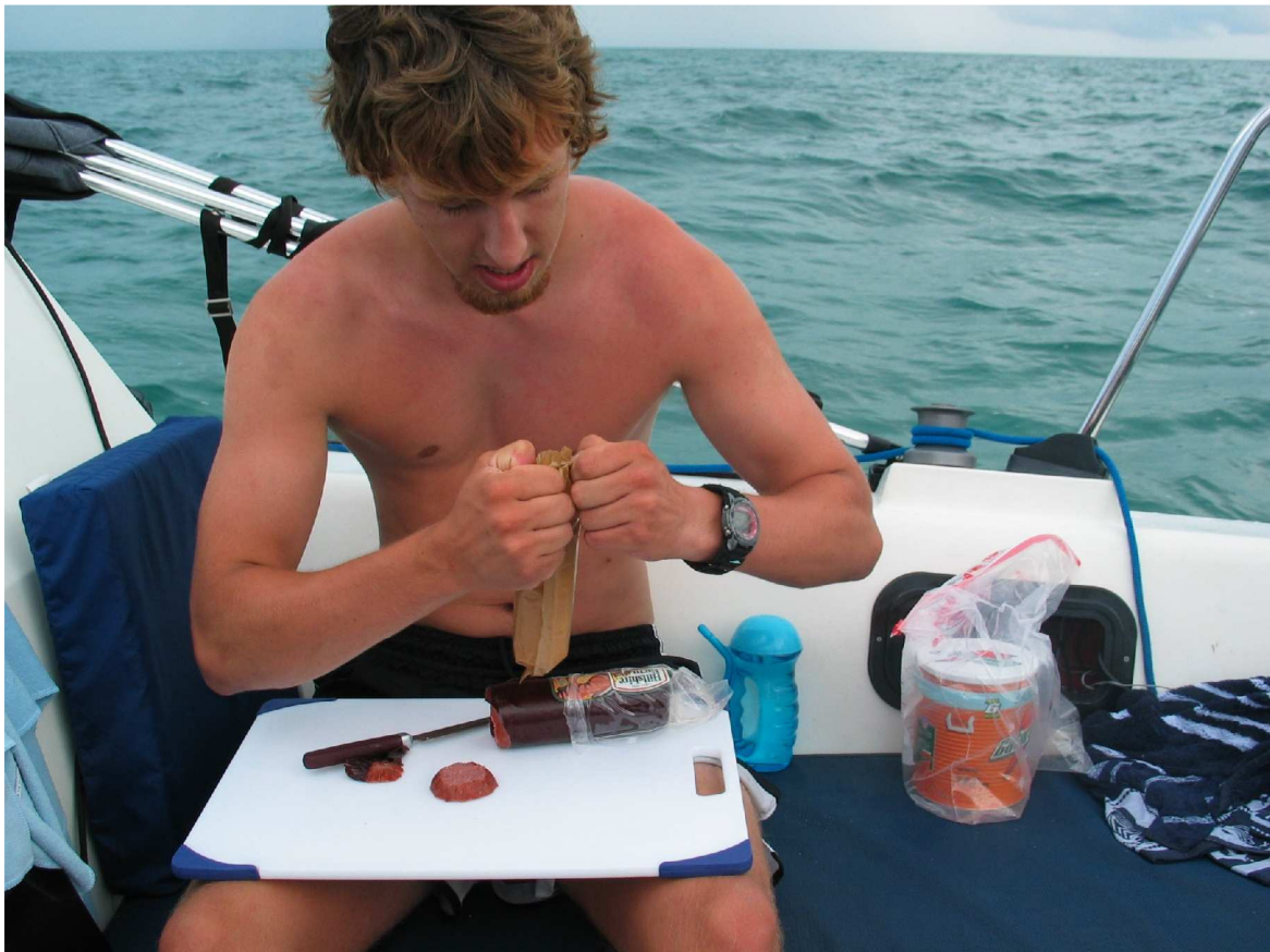
Eating lunch on the run in the middle of the Banks

We woke at the crack of dawn and immediately set out on our crossing of the Great Bahamas Banks. The skies were partly cloudy with a light wind of around 6 knots, and light to medium chop. By late morning it was clear that thunderstorms were developing in our area. The only question was where, and how big they would be.