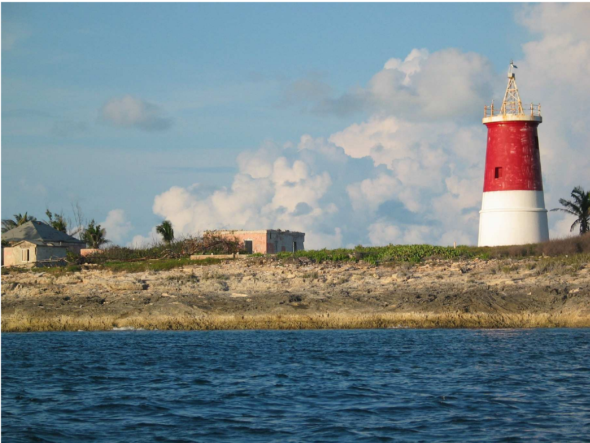
The same lighthouse viewed from the west side (ocean side)