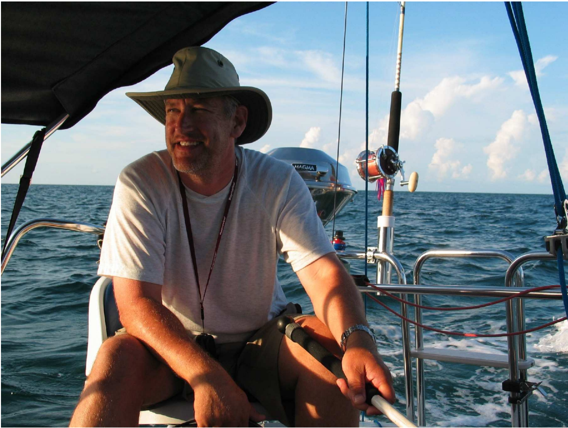
Happily leaving the storms behind