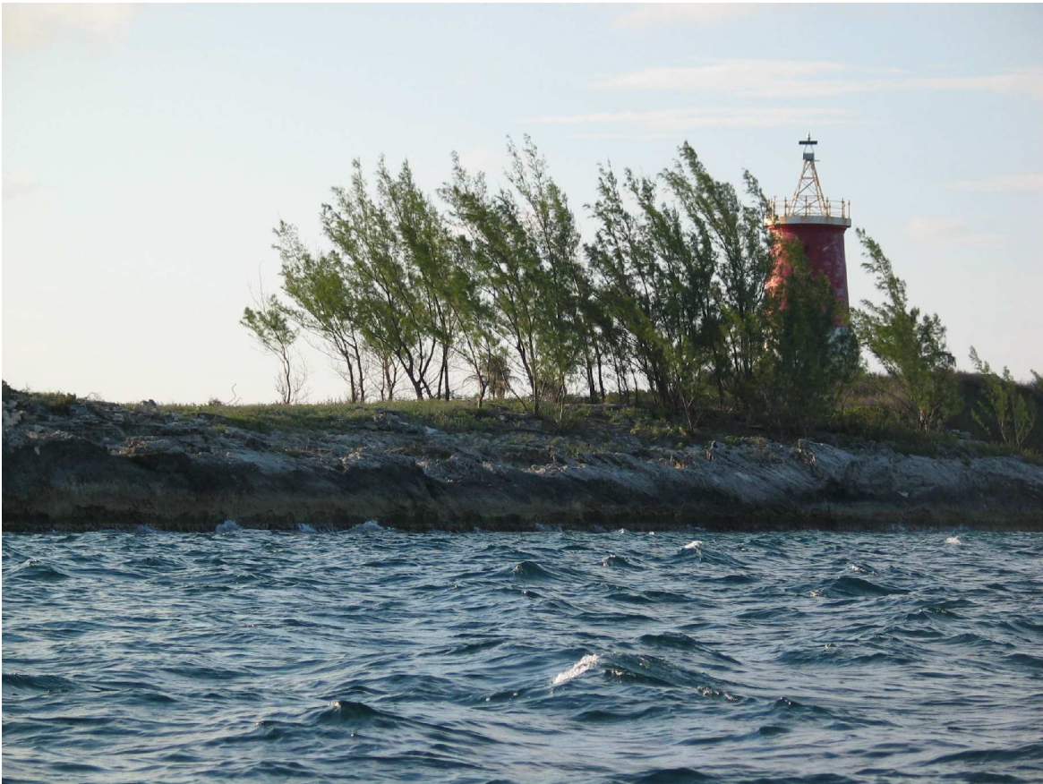
Lighthouse viewed from east side of Gun Cay