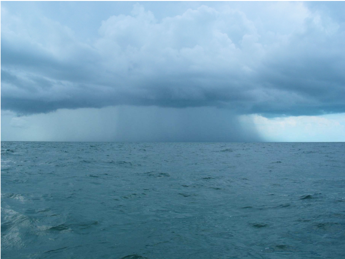
Ugly Storms and no sight of land. No escape!

knots I quickly came to the realization that we were not going to out run any storm if it decided to pass over us. But try we did, zig zagging our way across the middle of the Banks. First, we altered our course bearing from South Riding Rock (where we wanted to position ourselves for the Gulf Stream crossing) to South Cat Cay; then back to South Riding Rock; and finally back to Cat Cay. The zig zagging cost us time and fuel, and it ultimately failed in its objective.