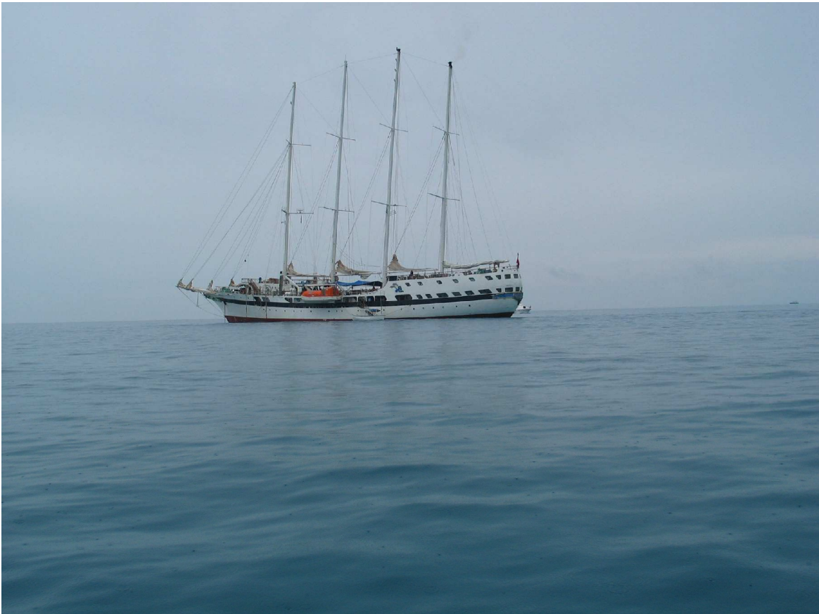
Look closely and you can see smoke. It was a hazy windless day.

Leaving the harbor was a snap with the new channel markers. Just outside the entrance channel, we saw a small cruise ship posing as a sailboat anchored. We got a good laugh at seeing smoke billowing out of the top of one of the masts; or should I say it was a smoke stack disguised as a mast. We made sure to sail past it under the longing gaze of the tourists that were trapped on the deck like bilge rats, waiting for their tender ride to town.