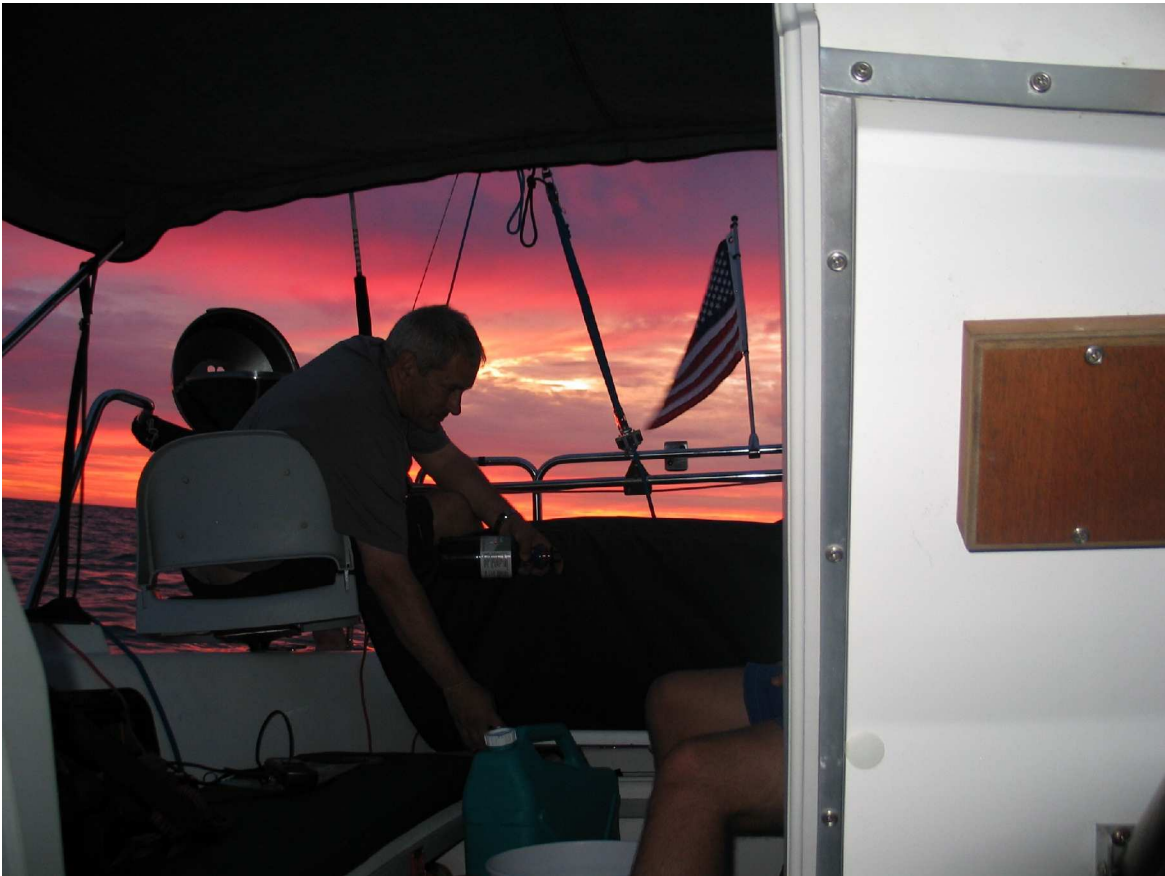
Breaking in the Magma during beautiful sunset.