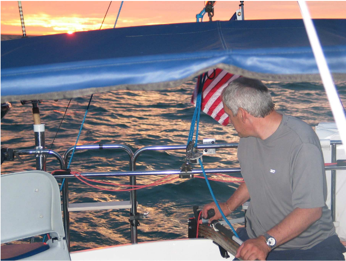
Backing down on the anchor. There was a nasty chop that got worse later that night.

Finally anchored, the sun was now just touching the horizon so we wasted no time breaking out our dinner. Because it was so late, and because we had no fish, I knew that the best course of action would be to keep dinner simple. However, we had only had a light snack for lunch and 18 year old boys eat a lot more than “light snacks”. They wanted something of substance, and I was dying to try out my new “magma” gas grill. So out came the hot dogs.