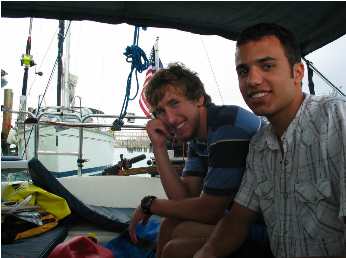
Nestled at Weech's just prior to departure

By mid-day the rain had moved on and the skies lightened. Although there was still a haze, we decided that we had been in port long enough. There were adventures to be had out there.