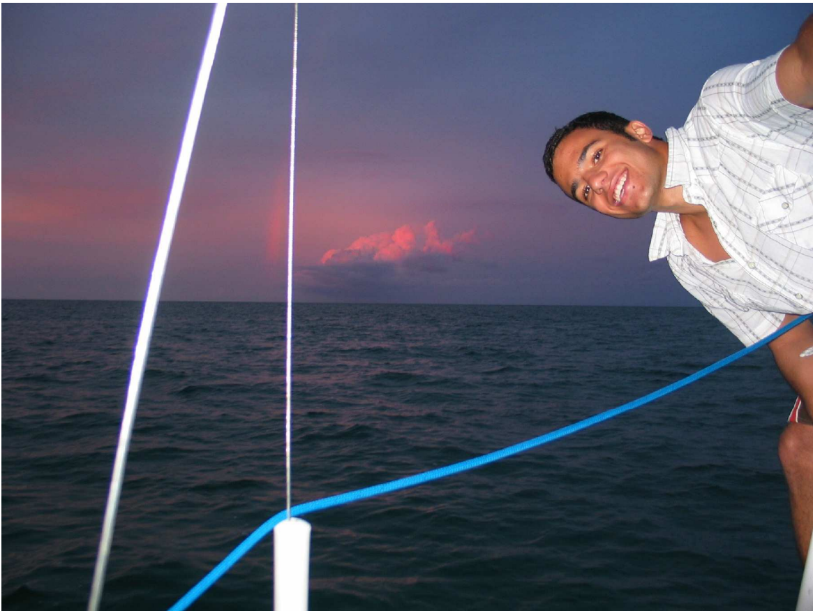
Skies cleared as the setting sun cast a pink glow on distant clouds